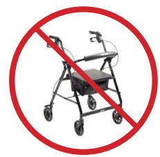
NO Four Wheeled Walker