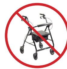
NO Four Wheeled Walker