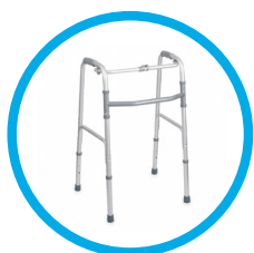
Standard (No Wheel) Walker