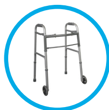
Front Wheeled Walker